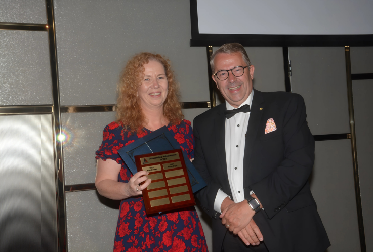
Pearl Ballroom Crown Sydney